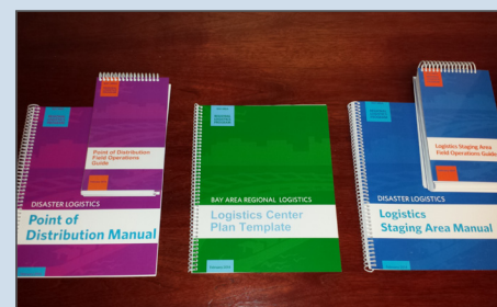
Bay Area Logistics Plans

The California Bay Area RCPT's 12 counties, including the cities of San Francisco, Oakland, and San Jose, have leveraged the work done by the RLP to build on their local capabilities in logistics planning. The Bay Area RCPGP has based its catastrophic planning on a 7.9 magnitude earthquake. In an earthquake of that size, an estimated 1,850,000 people would be without water. Approximately 1.1 million people and 400,000 companion pets are expected to be displaced, and in need of food and shelter.