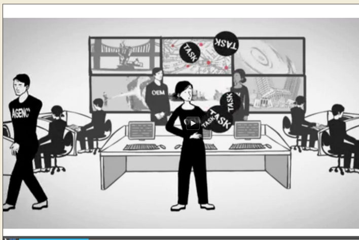
Scene from "Managing Consequences"